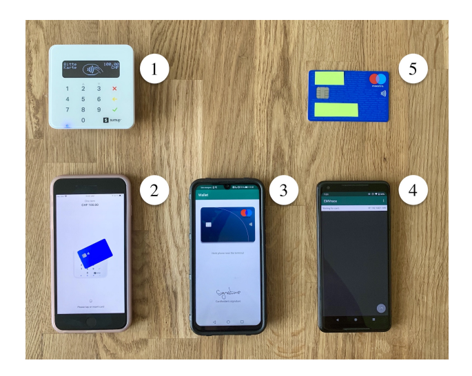
Figure 5: Setup of the testing environment for our proof-ofconcept implementation, displaying the following devices: (1) SumUp Plus Card Reader, (2) mobile phone running the SumUp app and connected over Bluetooth to the SumUp reader, (3) Android phone running our app in Card Emulator mode, (4) Android phone running our app in POS Emulator mode, and (5) contactless card. Note that the device (2) is not part of the attacker's equipment since in an actual store this device and (1) would be the payment terminal. In this scenario, the devices (3) and (4) would be the attacker's equipment and (5) would be the victim's card.